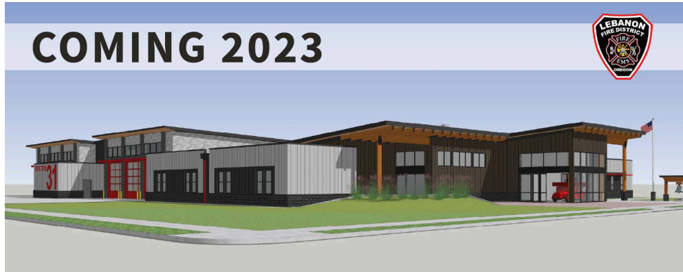
LEBANON FIRE DISTRICT STATION 31 & ADMINISTRATIVE OFFICES

RICE/ergusMILLER ARCHITECTURE INTERIORS PLANNING VIZLAB